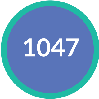
MATERNAL MORTALITY RATIO

Despite progress, Nigeria ranks the fourth highest maternal mortality ratio worldwide and the second highest for neonatal deaths rates worldwide (approximately 262,000 babies dying at birth each year). 14