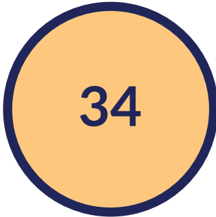
NEONATAL MORTALITY RATE

1,047 deaths per 100,000 live births (2020) 15